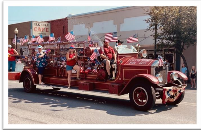
Burns City Councilors on the antique Burns Fire Department Ladder Truck, July 2021

The City Council identified its priority objectives and actions for the strategic plan during a series of detailed planning sessions with city councilors, city staff, and members of the public. The following table lists the priorities identified as key strategic issues in order of their importance to the City Council.