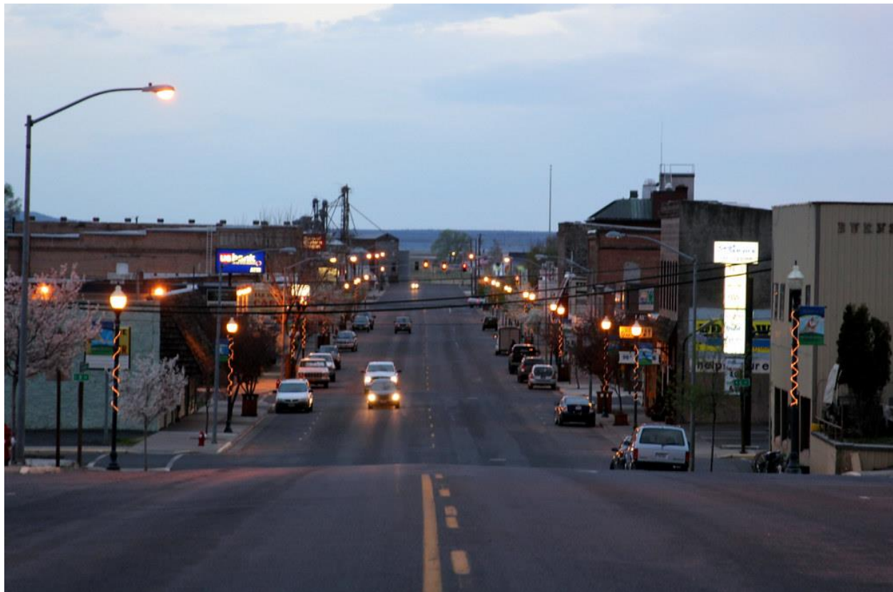
Downtown Burns at dusk