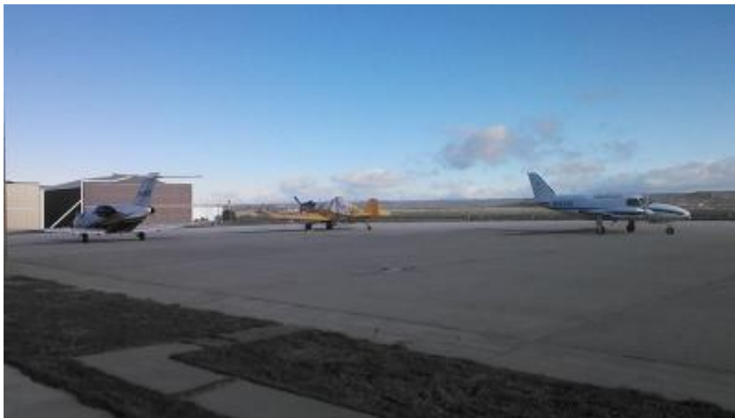
City of Burns Airport