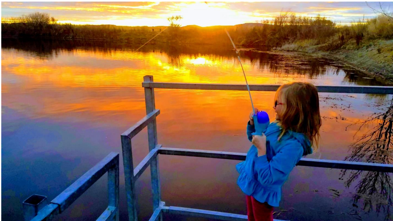
Young girl fishes at Burns Pond