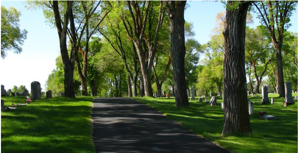
City of Burns Cemetery