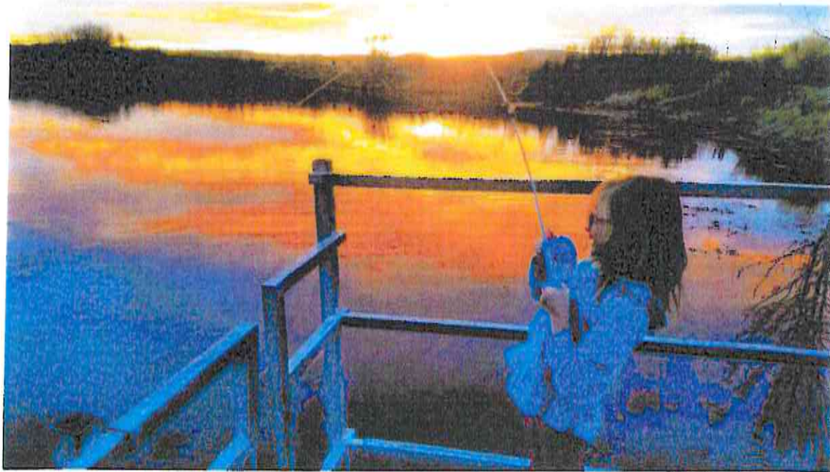
Viewing a sunset in Burns from the Burns Community Center