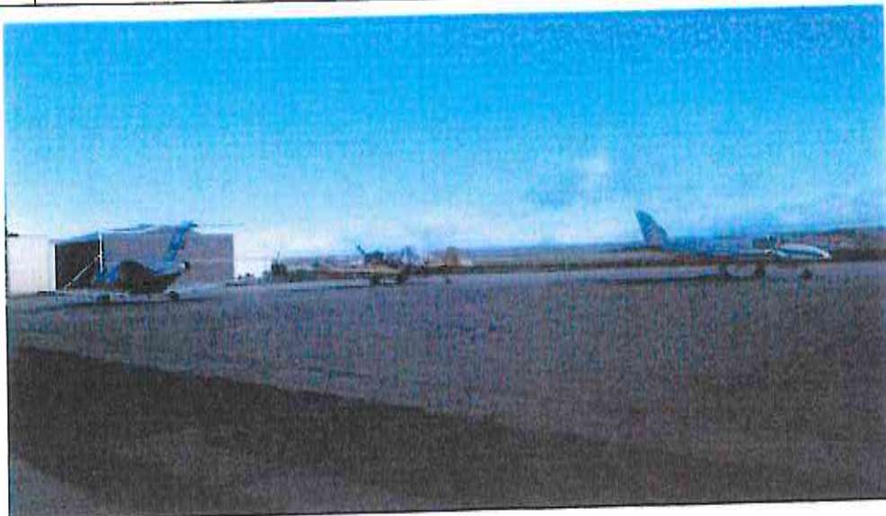
City of Burns Airport